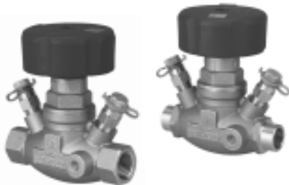
S1710 - DZR Brass Balancing Valve Solder End